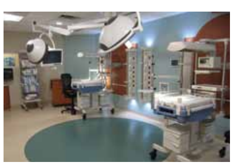
The unit has a dedicated room where medical procedures can be performed.

Special care was put into designing a unit that fosters healing for fragile and premature infants. In the hospital's old NICU, infants were cared