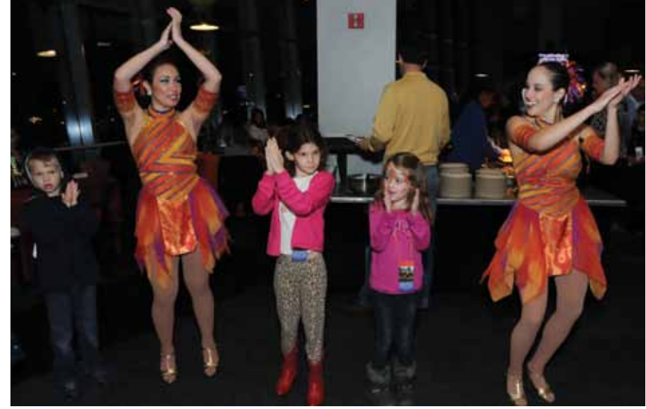
Circus performers entertained the children at the Patron's Party prior to the circus performance.