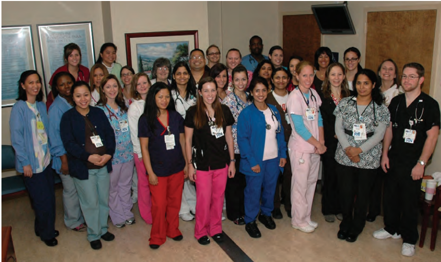
The Cardiac Telemetry Unit recently earned a 2011-2014 Silver Beacon Award for Excellence from the American Association of Critical-Care Nurses. Pictured are some of the evening and day shift nurses and clinicians who provide care to patients with cardiac-related conditions on the unit.

Recipients of the silver Beacon Award must demonstrate continuous learning and effective systems to achieve optimal patient care.