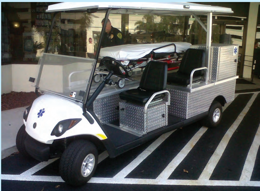
The hospital will soon have a new emergency code cart, similar to the one pictured here, that will allow the hospital's Rapid Response Team to respond quickly to visitors or employees needing medical assistance when a Code Purple is called. It is one of 10 projects to recently receive funding from the Foundation's Women's Leadership Council.

PNC Bank is sponsoring the 2012 Women's Leadership Council programs so that all of the money contributed by the members goes toward hospital projects.