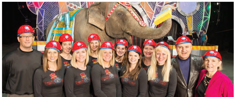
Circus Committee members pose with Asia the elephant, the star of the show, Built to Amaze!