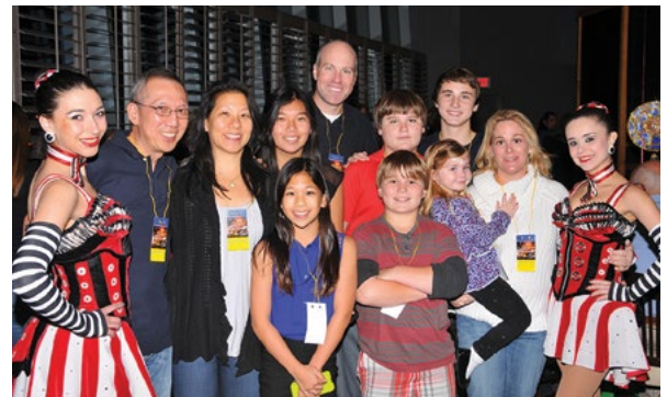
Members of the Bailey family representing The Bailey Family Foundation, this year's Big Top sponsor