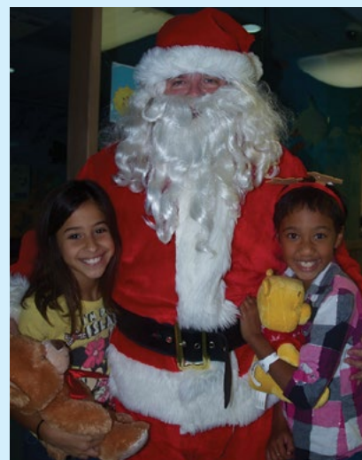
Santa made a surprise visit to deliver presents to patients who were not able to be home for the holidays.