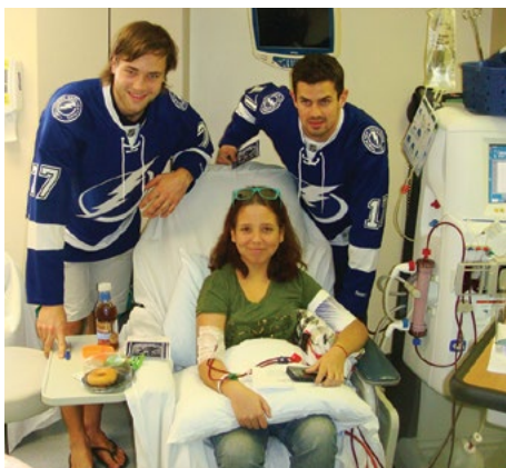
Tampa Bay Lightning defenseman Victor Hedman and center Alex Killorn visited with patients in the TGH pediatric dialysis unit.